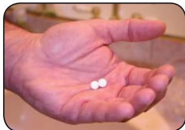
Take medications as instructed