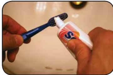
Use desensitizing toothpaste

Now that we've placed your permanent inlay or onlay, it is important to follow these recommendations to ensure its success.